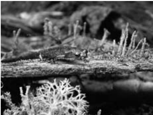
BROOKE L. TALLEY

Bolitoglossa diaphora demonstrates a high degree of sexual dimorphism in color pattern; males are typically dark gray, whereas females are mottled orange, red, yellow, and brown.