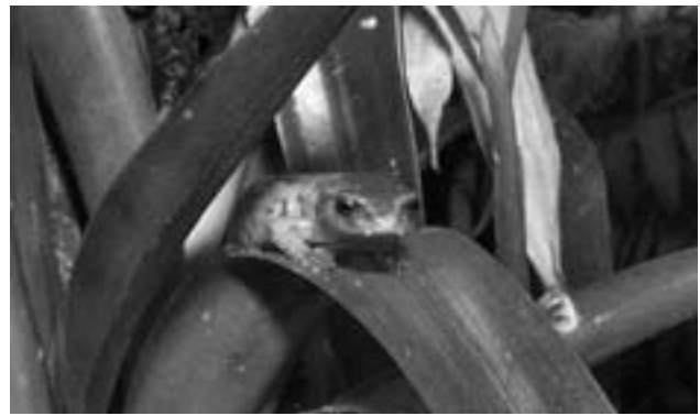
KENNETH L. KRYSKO

Bolitoglossa diaphora demonstrates a high degree of sexual dimorphism in color pattern; males are typically dark gray, whereas females are mottled orange, red, yellow, and brown.