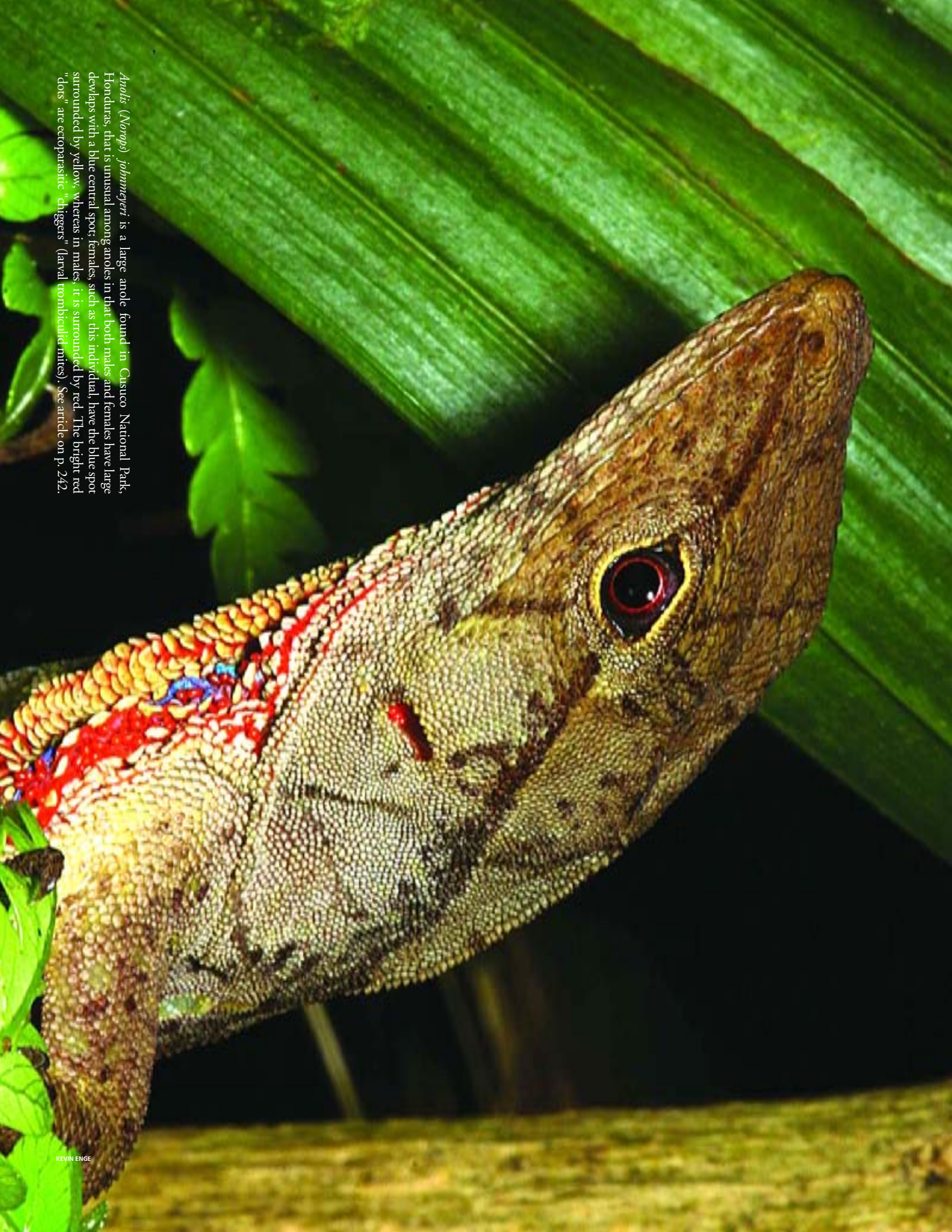
Anolis (Norops) johnmeyeri is a large anole found in Cusuco National Park, Honduras, that is unusual among anoles in that both males and females have large dewlaps with a blue central spot; females, such as this individual, have the blue spot surrounded by yellow, whereas in males, it is surrounded by red. The bright red "dots" are ectoparasitic "chiggers" (larval trombiculid mites). See article on p. 242.