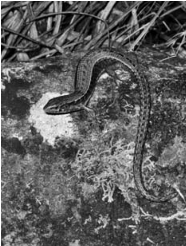
KEVIN M. ENGE

in distribution to Cusuco National Park. This species demonstrates a high degree of sexual dimorphism with respect to its color pattern; males are typically dark gray, whereas females are mottled orange, red, yellow, and brown. Cryptotriton nasalis is endemic to moderate and intermediate elevations of northwestern Honduras, and it is known from localities outside of Cusuco National Park in the Sierra de Omoa. These tiny salamanders derive their name from their large nostrils, which can approach the size of their eyes. In the dwarf forest, this species is found inside bromeliads. Only one species of frog is known to occur in the dwarf forest, the recently described bromeliad-dwelling “ Hyla ” melacaena . This species is endemic to the Sierra de Omoa. An adult female was discovered as it hopped from a bromeliad as a field crew brushed past, and these frogs are suspected to breed in the water-filled axils of arboreal bromeliads.