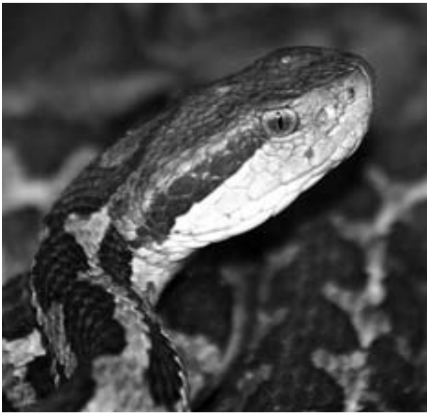
The colubrid Ninia espinali is a small, semifossorial snake found at intermediate elevations.