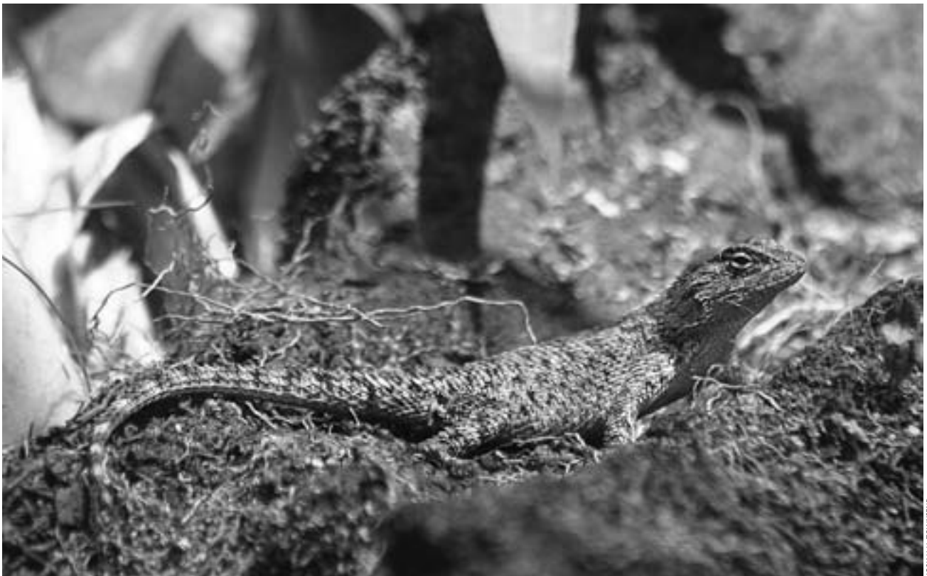
JOSHUA H. TOMINSEND

The Emerald Swift ( Sceloporus schmidti ) is a common cloud forest inhabitant throughout its range, and can be found in open areas that receive the most exposure to sunlight.