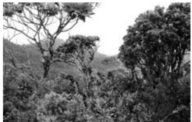
Heather wind scrub formation, around 2000 m elevation, on top of Cerro Cusuco, July 2005.