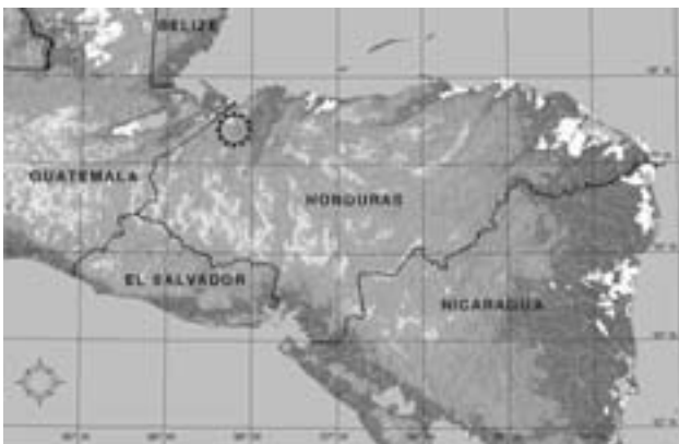
Honduras is located in Central America; the general location of Cusuco National Park and the dwarf forests is marked with a circle.

Perhaps the most distinctive habitat formation found in these mountains is the dwarf forest, which is restricted to the